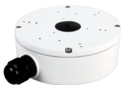
A22 Junction Box