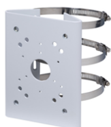
A36 Pole Mount