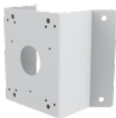
A35 CORNER MOUNT