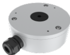
TC-P54BM SPEC: V5 JUNCTION BOX